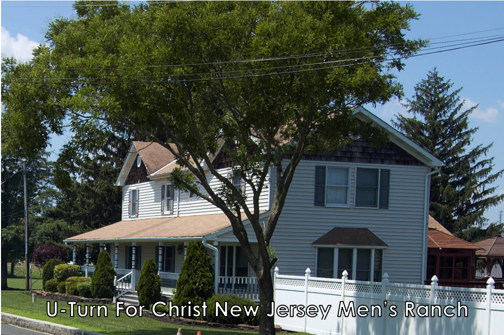
U-Turn For Christ New Jersey Men's Ranch