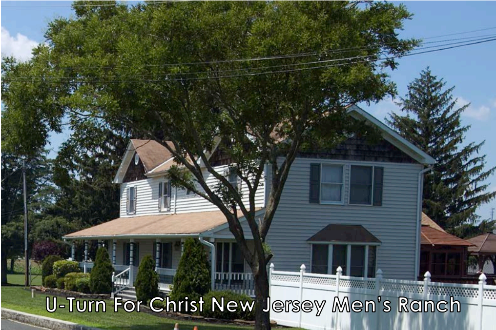
U-Turn For Christ New Jersey Men's Ranch

We were blessed to see so many of our friends at the U-Turn Independence Day pig roast. Thank you so much for celebrating with us. Words cannot express how encouraged we were so we are sharing a few pictures below. There are more on our website.