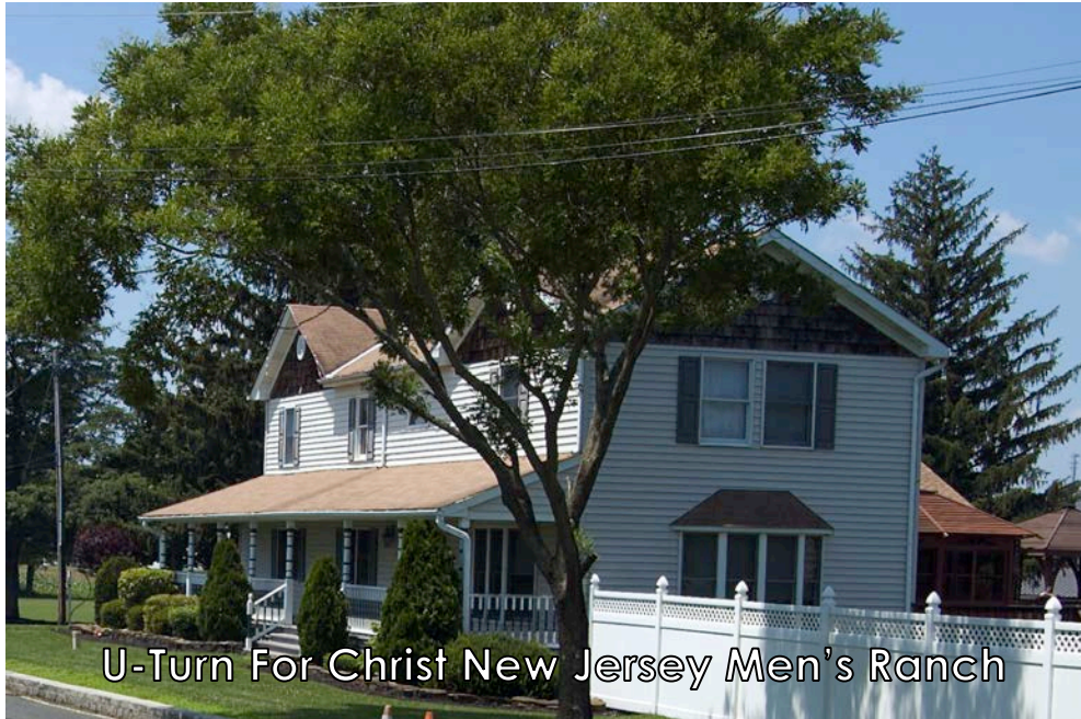
U-Turn For Christ New Jersey Men's Ranch